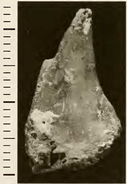
Fig. 3. Otitidae gen. indet.: radius sin. distr., NMNHS 151 - ventro-lateral view

Tibiotarsus dex. dist., NMNHS, No 148: Only the diaphysal part is preserved. The medial side has a medial bend in cranial view, similar to T. tetrax . Sulcus extensorius is also practically identical to that of T. tetrax . The presence of an edge and a foramen distinguishes the fossil specimen from the Little Bustard. The measurement „c“ (Table 6) is very approximative.